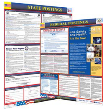
Laminated All-In-One Posters Available in English and Spanish

Order your posters now to remain in compliance through 2016!